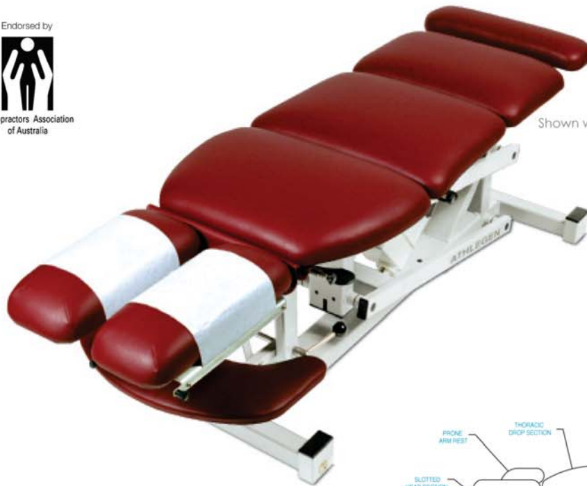
Shown with the Advantage Top