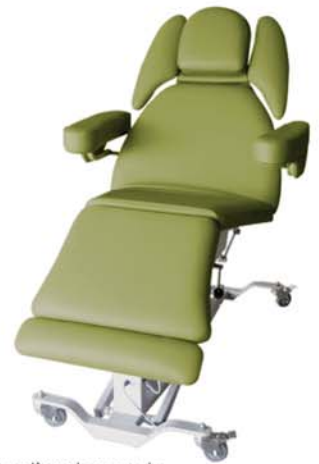
Shown with optional armrests, body/shoulder supports, and extendable footrest

The sturdy design helps to optimize your performance whilst achieving maximum comfort and support for your clients. Combine this with quiet height adjustment and you have discovered just a few reasons why this is the perfect table for your salon or spa.